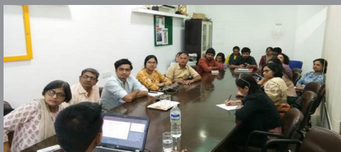
Faculty members in session