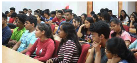
Students in session by members of ACLUDE