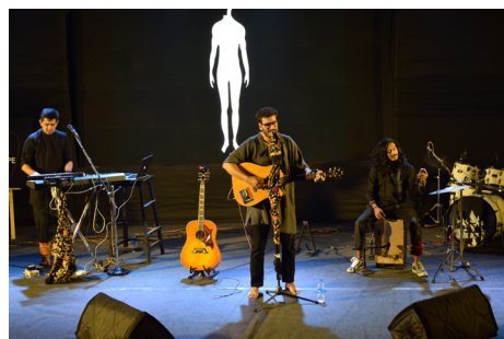
Musical Performance of a fusion of contemporary and ethnic genre by the band Alif.