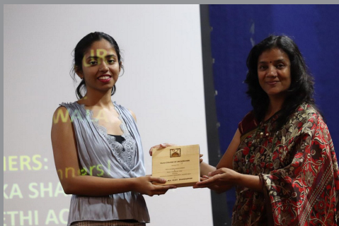
Principal awarding the certificates to the winners