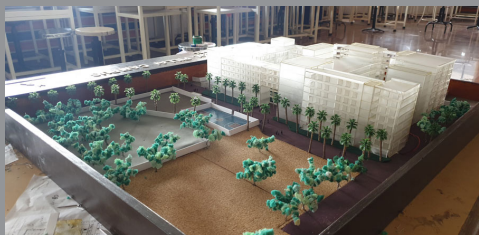
Model of Pillai's College, Panvel's Campus

The model was inaugurated in the annual festival of Pillai College, 'ALEGRIA 2019-2020'.