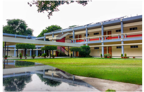
IIT Kanpur campus