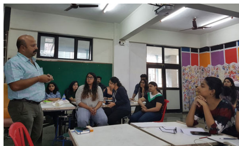
5th year students in the session