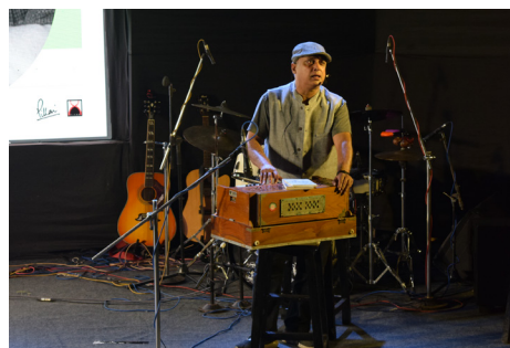
Classical Musical Performance by Piyush Mishra