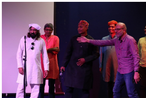
Faculties dressed up in traditional attires

The event was also accompanied by the release of the cover page of the annual magazine VoX- The Voice of PiCA.