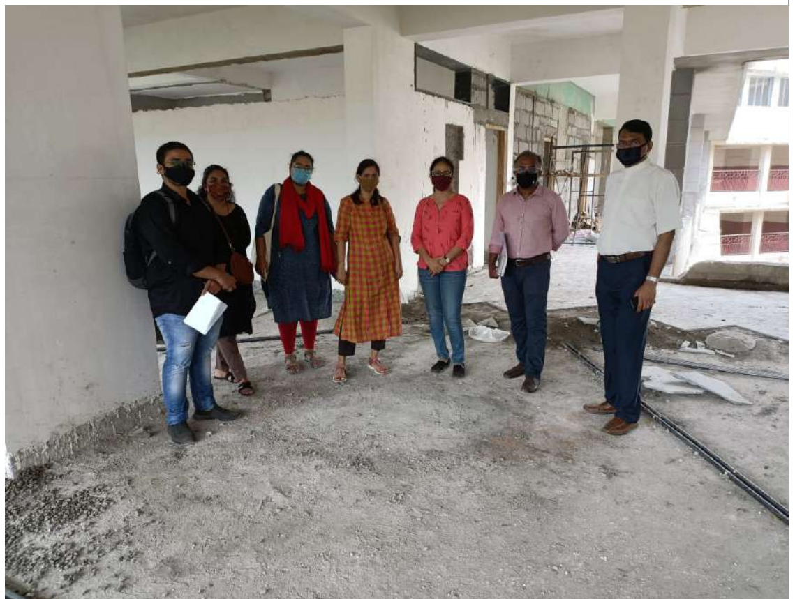
All attendees on site