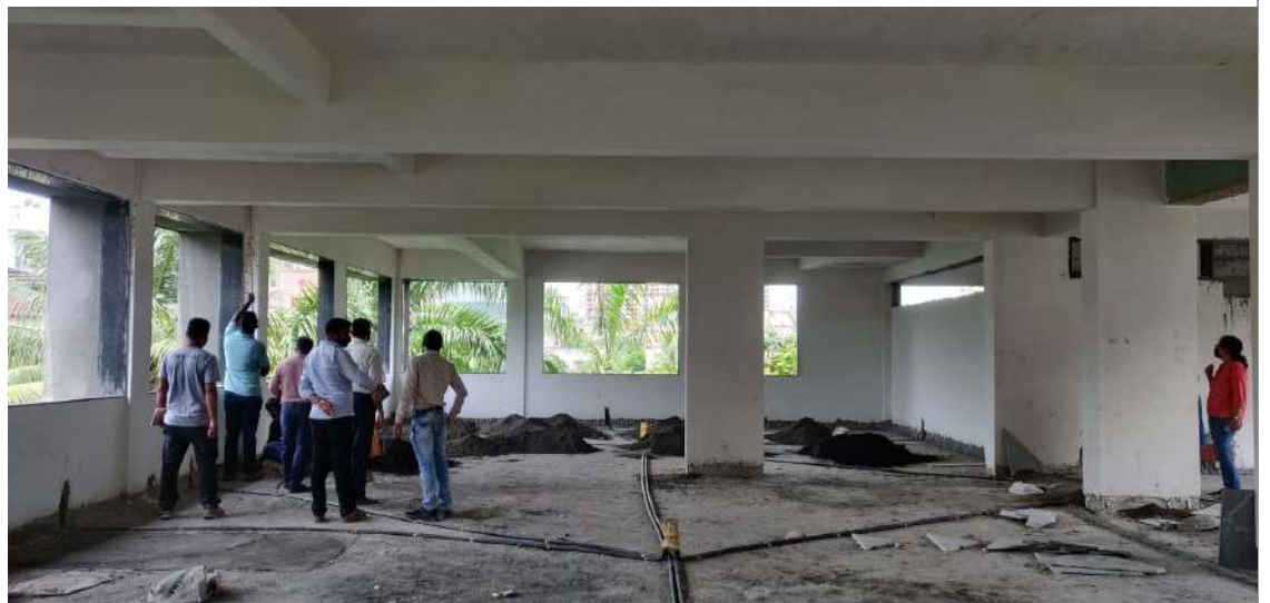
Site of Incubation Center