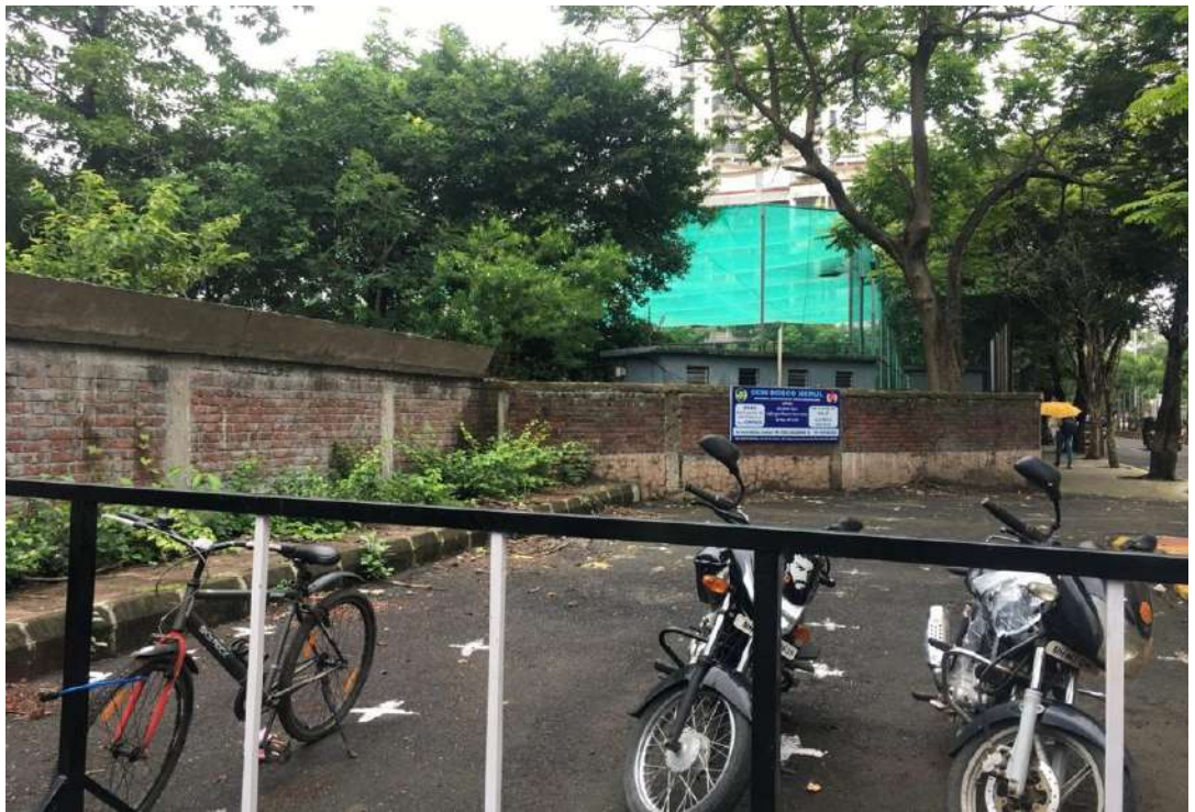
Compound Wall site for branding ideas

Option1: Floor plan layout for Incubation Centre: