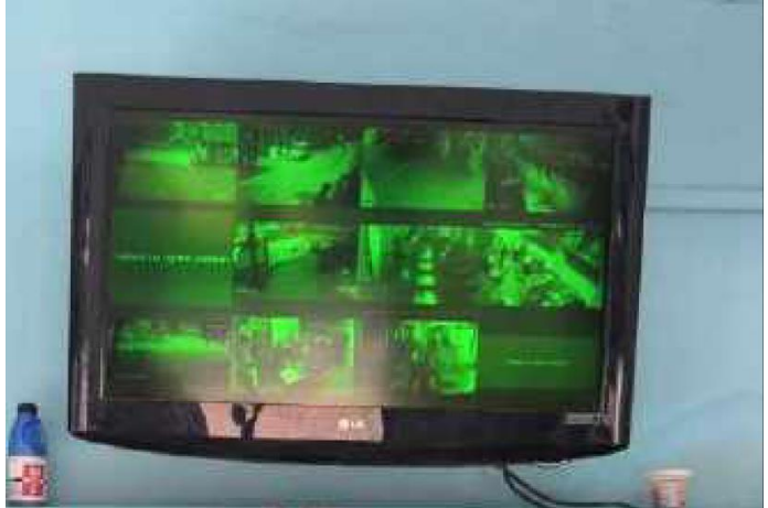
CCTV monitoring system